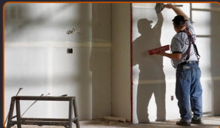
CLEAN AND PURIFY ROOM